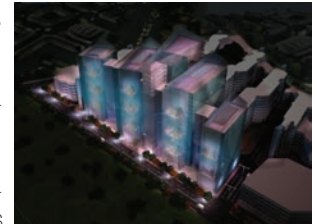
BHARAT DIAMOND BOURSE