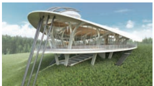
SHRI SAI DASHAMA TEMPLE

B. Arch, Academy of Architecture, Mumbai, 1996