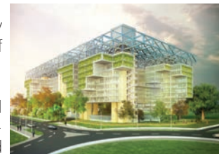
NATIONAL TAX H.Q.-DELHI

Mixed Use Office Building, Godrej Properties, Chandigarh, India: Principal Designer for a 680,000 gsf mixed-use LEED Platinum building. Design in 2008. Substantial Completed 2014