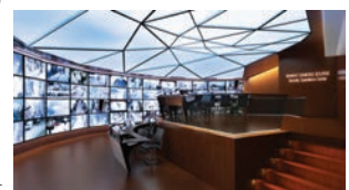
BHARAT DIAMOND BOURSE

Chicago Tribune, Chicago Sun Times, SEPA Record: Exelon Pavilions at Millennium Park, extensive write ups and third page displays.