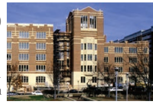
UNIVERSITY OF MARYLAND

Johannisviertel Tacheles Project, Berlin, Germany: Project captain (designer part at HBRA) for a 201,285 sft mixed-use building, in Orianieburger Strasse Berlin.Design complete 2004