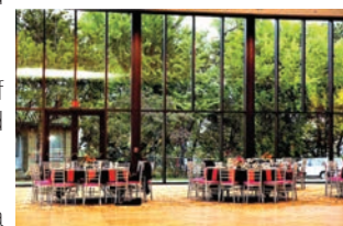
NORTH SUBURBAN SYNAGOGUE