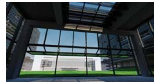
COGNIZANT AT SIRUSERI