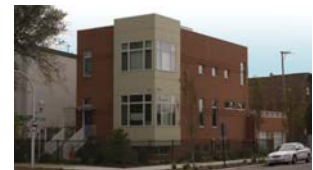
ECO DECO HOUSE