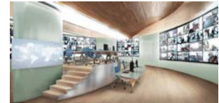
BHARAT DIAMOND BOURSE-SOC