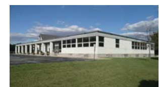
ST. PAULS EPISCOPAL CHURCH