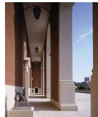
SOUTHERN METHODIST UNIVERSITY