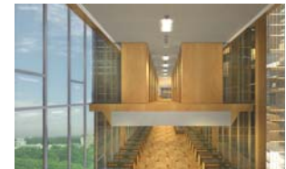
NATIONAL TAX H.Q.-DELHI

2006 Harvard University-Cambridge, Massachusetts Loeb Fellowship Nominee