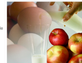
The reason low-carb diets work is that your body normally uses carbs as a fuel first.

For more ideas on eating healthy stay in touch with us!