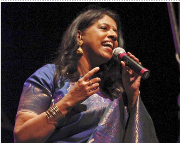
Kavita Krishnamurthy Subramaniam performs June 22 in Los Angeles.