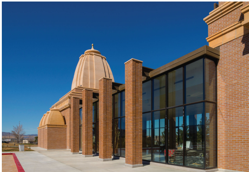
Top L: Interior view of main hall Top R: View of main entry from south Bottom L: View from SE Bottom R: View from SW