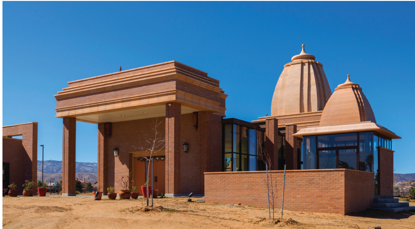
Top L+R: Conceptual sketches evolution of form Bottom: View of Temple complex from NE

Client Brief: The clients requested a Temple dedicated primarily to Lord Vishnu, one of the major deities of most Hindu traditions and the Supreme God of the 'Vaishnavite' tradition. The client also requested additional accommodations for 6-8 other deities of the Hindu pantheon as selected by the community, with a traditionalist Temple of northern and southern Indian confluence placed behind modernist supporting facilities designed to inspire younger generations to fervent worship.