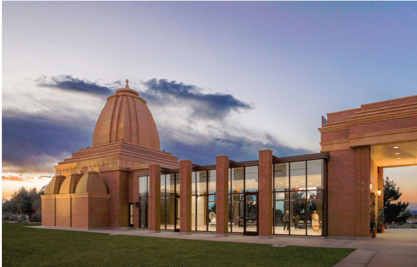
Top: View of Main Temple from SW

CSA Partners Ltd. Architects & Urban Designers