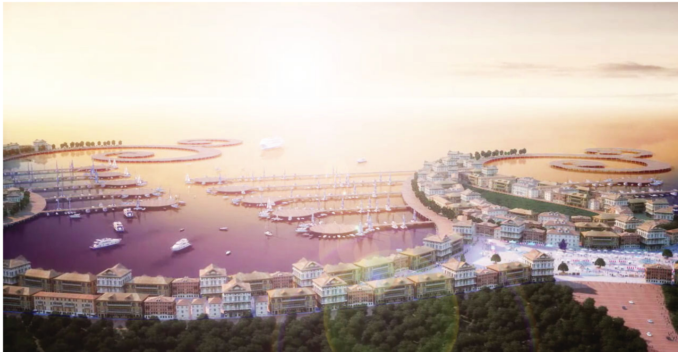
Top: View of Marina Top R: Sketch Concept

CSA Partners Ltd. Architects & Urban Designers