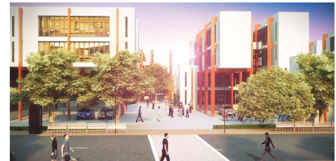
L: View of Marina and Markets R: Pedestrian tendrils B: Neighborhoods

City Y is fundamentally about the way we dwell, physically, spatially and spiritually. The time has come where we define how we rejuvenate our way of dwelling such that our mothers and children can start liv-