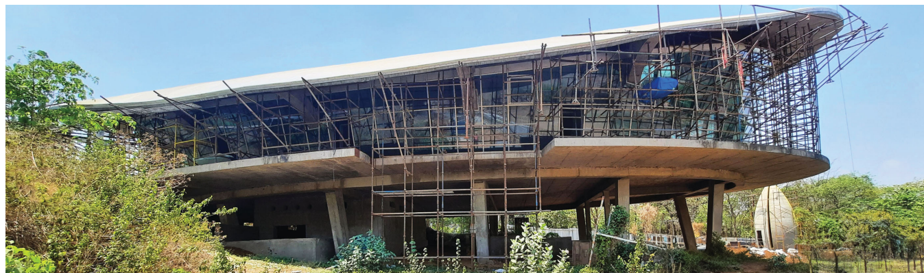
Top: Rendering of Temple Bottom: View from NW of glazing

email: contact@csa-partners.com web: www.csa-partners.com