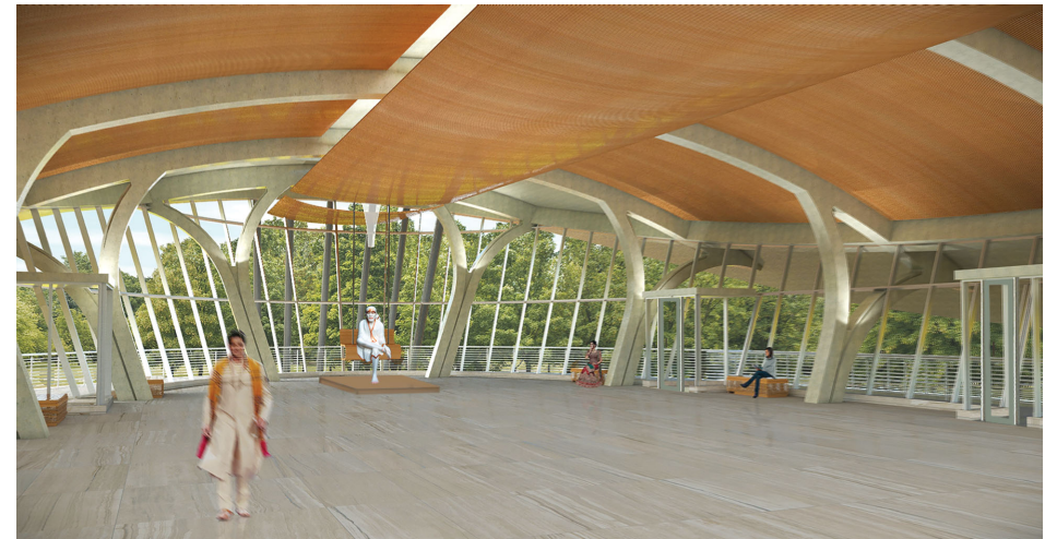
Top: Views of petals toward Shri Sai Middle: Interior Perspective View Bottom R:View from road at south Bottom L: Sectional Sketch