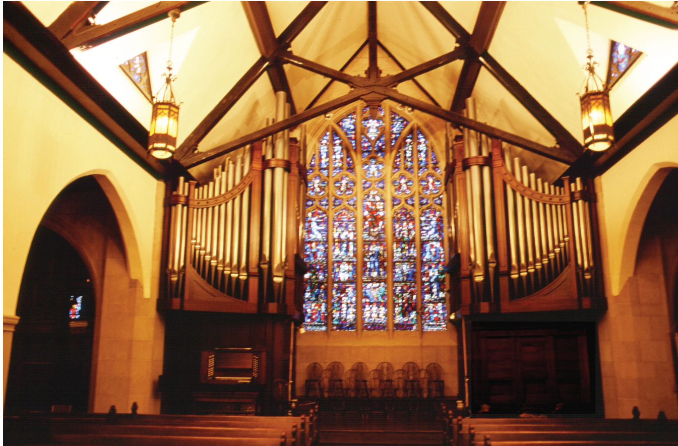
Top : View of renovated nave

CSA Partners Ltd. Architects & Urban Designers