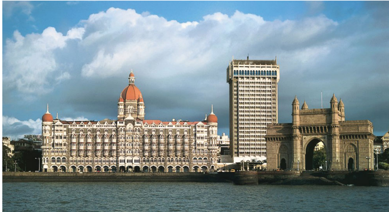
Top: View of Historic Taj Hotel and Taj Intercontinental Bottom L & R: Historic Taj Hotel Night View with model study

CSA Partners Ltd. Architects & Urban Designers